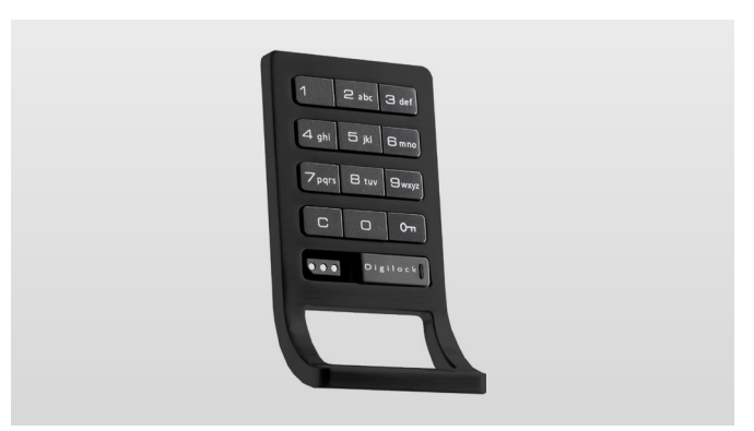
CS - Shared Use