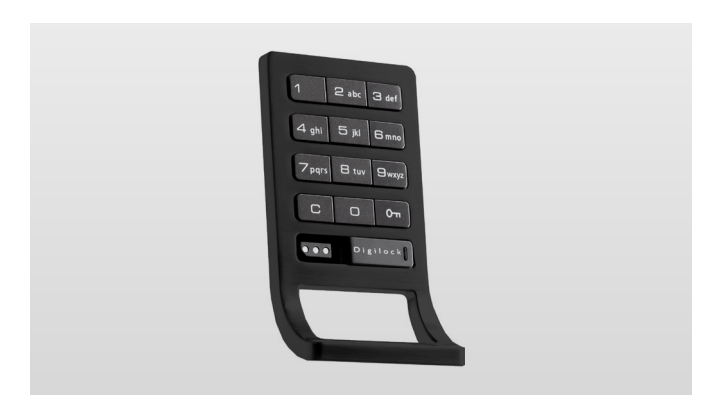
CP - Personal use